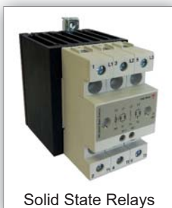
Solid State Relays

The low load density per cm 2 of elements reduces oil cracking problems and limits purges, all for an optimized investment. These mold temperature controllers are equipped with pumps covering a wide array of throughputs (Salmson, Allweiler or Speck with magnetic coupling). This ensures a small temperature gap between the incoming and outgoing oil..