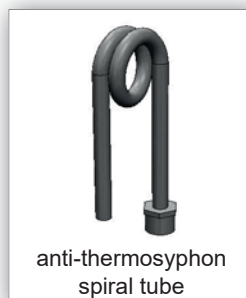
anti-thermosyphon spiral tube

This option allows for more precise control and a prolonged life when compared to a standard relay.