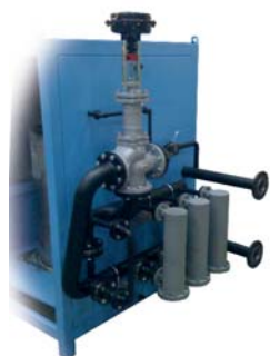
3 channel valve on cooling circuit