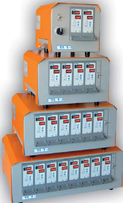
8 Series cabinet single-zone