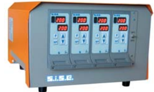
8C4S - 4 zone cabinet MONOZONE