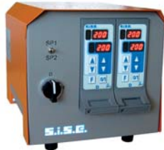
4 zone cabinet PREMIER Configuration