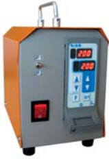
Twin zone cabinet PREMIER Configuration

The 8 Series controllers offer 2 levels of user interface for all types of applications, from the most simple to the most sophisticated, especially with the communication capability to Euromap 17/66, CAN Bus, USB and RS 232/485 standards.