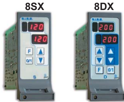
8SX Single-zone Controller