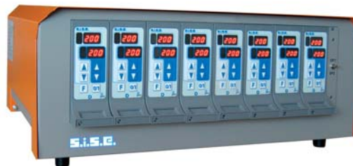
16 zone cabinet COM Configuration