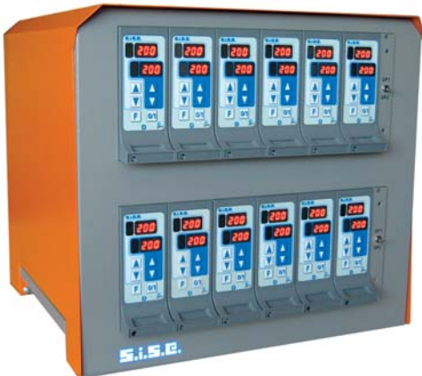
24 zone cabinet PREMIER Configuration