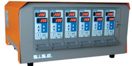
12 zone cabinet COM Configuration