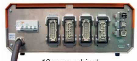
16 zone cabinet SISE standard wiring. Customized wiring available upon request.