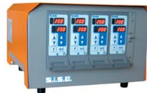
8 zone cabinet PREMIER Configuration