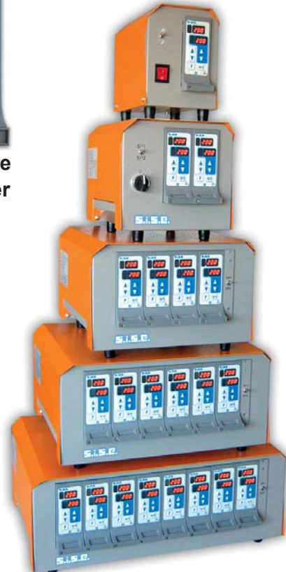
8 Series cabinet dual-zone

The 8 series controller has been designed for molding applications with a low number of control zones, particularly in the automotive and technical molding industry.