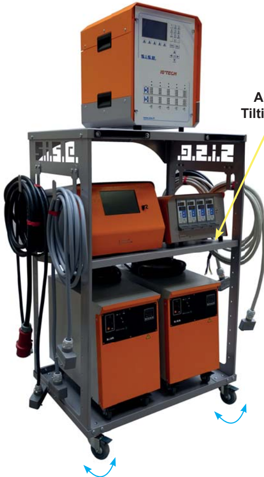
Adjustable Tilting Shelves