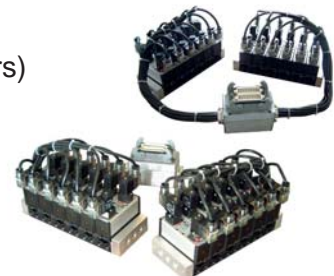
2-10 station pre-wired pneumatic manifold systems (simple- or double-solenoid)

SISE is the only company whose hydraulic power pack uses a variable displacement pump. Thanks to this pump, no oil-cooling system is needed and the noise level is greatly reduced.