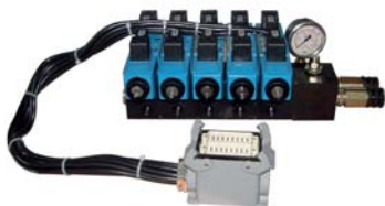
2-10 station pre-wired hydraulic manifold systems (single- or double-solenoid)